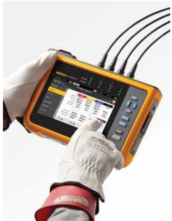
Easily navigate using the large color touchscreen

When downloading data from the Fluke 1770 Series Power Quality Analyzers the included Energy Analyze Plus software package can compare measured voltage and current harmonic statistical data to different standards, like EN 50160 or IEEE 519, to determine if they exceed compliance limits. This powerful predictive maintenance feature enables current harmonics to be observed before distortion appears in the voltage allowing you to prevent unexpected failures or non-compliance situations and increase system uptime. With the proliferation of inverter-based loads and power generation, keeping current harmonics in check is becoming increasingly critical to ensure reliable power quality and avoid system downtime.