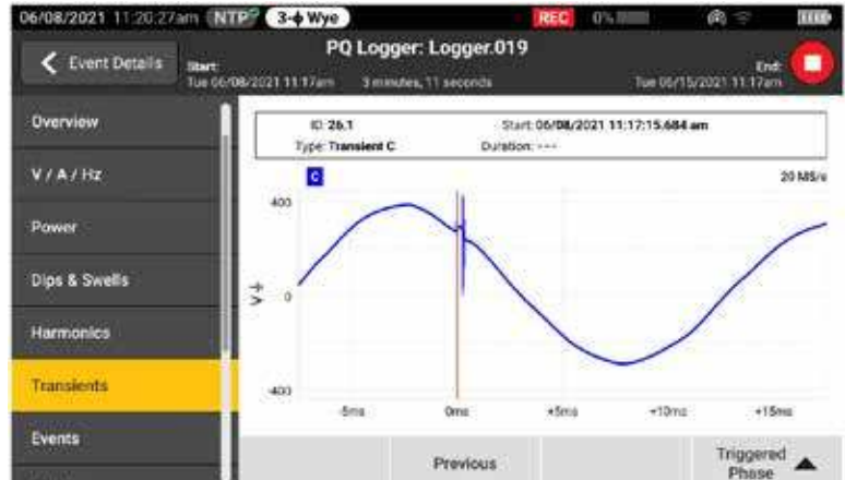
View real-time voltage transitory events while logging for faster troubleshooting

Transients negatively impact otherwise healthy systems every day and their potential to damage your equipment can't be underestimated. Whether your system is experiencing impulsive or oscillatory transients, the results can be devastating and cause problems ranging from insulation failures to total equipment failures. The Fluke 1775 and Fluke 1777 incorporate advanced transient capture technology to help you clearly identify high-speed voltage transients, so you have the data you need to stop them in their tracks. The Fluke 1775 Power Quality Analyzer has 1MHz sampling capability to capture fast transients, while the Fluke 1777 Power Quality Analyzer has 20MHz sampling capability to capture the fastest transients in high detail.