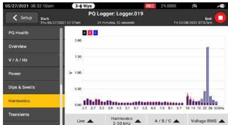
A full range of harmonics are available from the first 50 integer harmonics and from 2 kHz to 30 kHz

The Fluke 1770 Series was designed to be safe and easy to use in any measurement environment. The 1770 Series allows you to capture a full range of power quality variables as well as high-speed waveforms, high-speed transients, and higher frequency harmonics, all of which are instantly viewable on the large, high-resolution screen. With a best-in-class CAT IV 600 V / CAT III 1000 V overvoltage rating, these analyzers can be used at the service entrance or downstream, measuring AC and DC inputs, and harmonics measuring up to 30 kHz. With the 1770 Series you can be confident that you'll capture the data you need to make better maintenance decisions no matter the task.