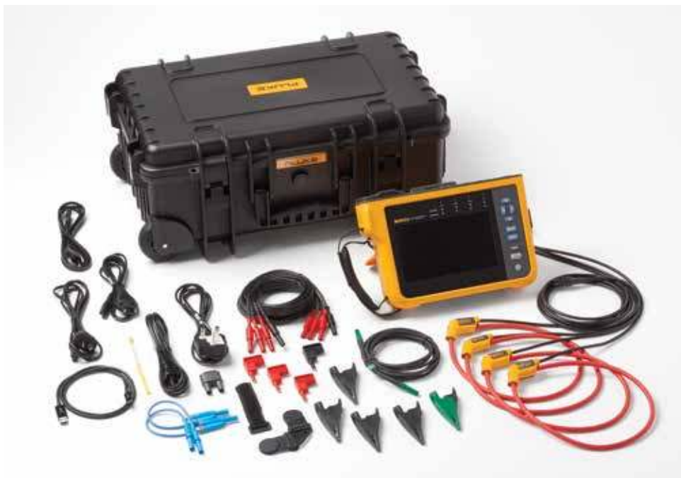
Fluke 1777 Power Quality Analyzer. Note: Included items vary by model and are listed in the “Ordering information” table.