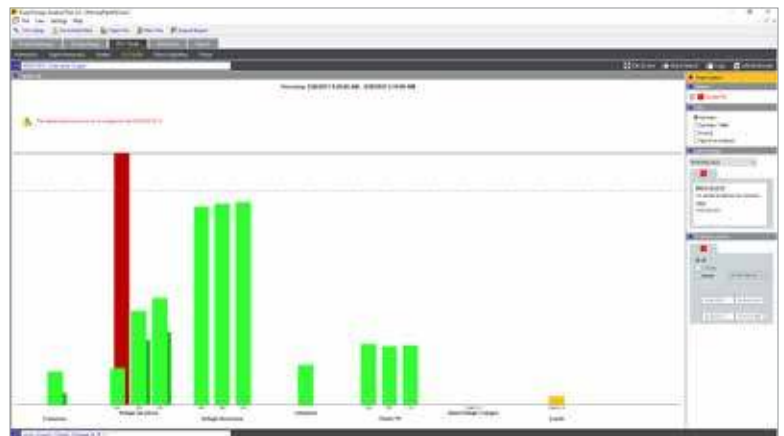
Fluke Energy Analyze Plus: Power quality health summary